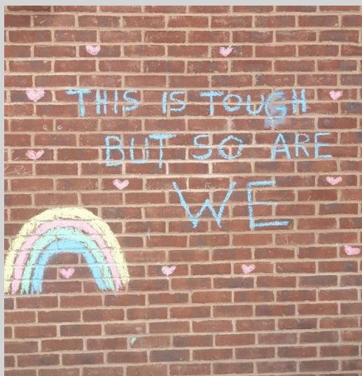
This was seen on a wall in Knaresborough. Not quite Banksy but great sentiment nevertheless!