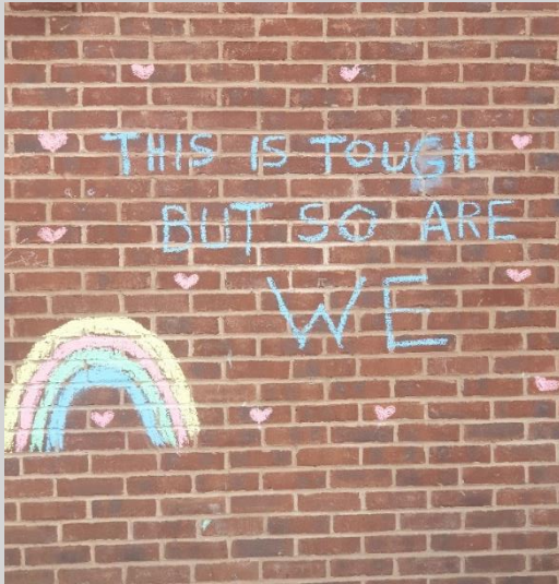
This was seen on a wall in Knaresborough. Not quite Banksy but great sentiment nevertheless!