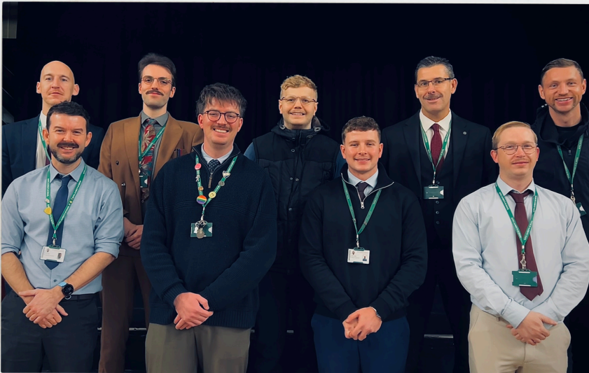
Our wonderful 'staches

Mojoker: Funniest and most creative 'stache